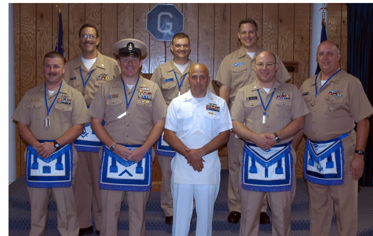
4 th Annual Navy Night