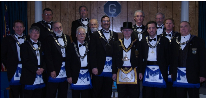
The Grand Master's “Town Hall” Visit to Kempsville Lodge at the February Stated Communication

Let's keep these Brethren and their families in our thoughts and prayers. I'm sure they'd appreciate a phone call or visit.