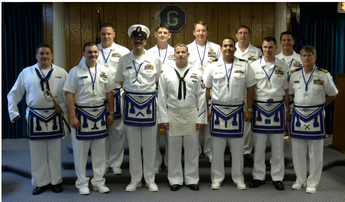
Our local sailors take over the helm for Kempsville's 5th Annual Navy Night

Don't forget, Brethren, Masonic Recognition Day is the first day of each month. Wear your Masonic paraphernalia proudly!