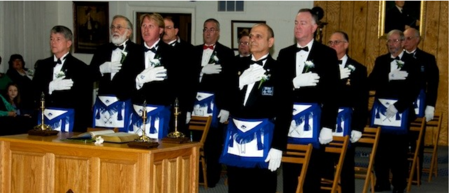
The 2011 Team of Officers were installed before a packed Lodge on December 18 th .

For the latest, up-to-date schedule, check our web site at www.kempsvilleglodge.org .