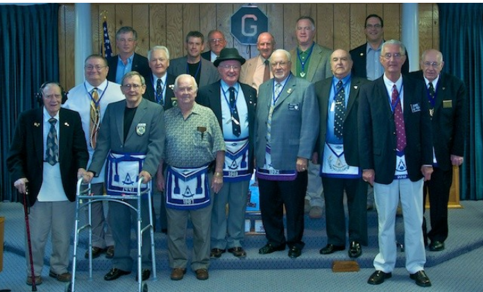
16 Past Masters attended the September 27 th Past Masters' Night.

The six most important words: “I admit I made a mistake.” The five most important words: “You did a good job.” The four most important words: “What is your opinion?” The three most important words: “If you please.” The two most important words: “Thank you.” The least important word: “I.”