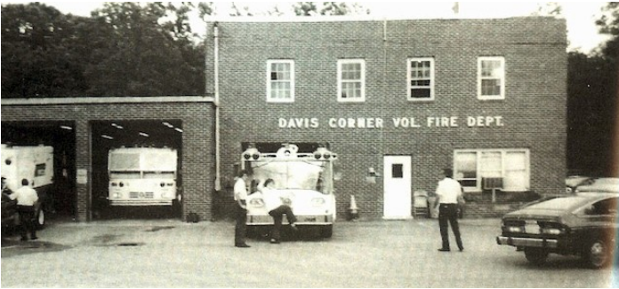
The second floor of Davis Corner Volunteer Fire Department was the home of Kempsville Lodge until September of 1957.