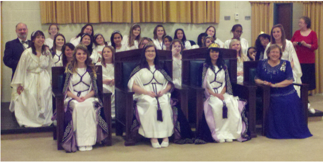
Jobs Daughters Grand Visitation on February 18 th at Grandby Street Temple

Current dues collections for 2012 are now at 75% paid; 25% are yet outstanding. If you have remitted your 2012 dues, thank you! If you have not, please do so promptly (dues are $100.00). The Lodge depends on the dues for day-to-day operations.