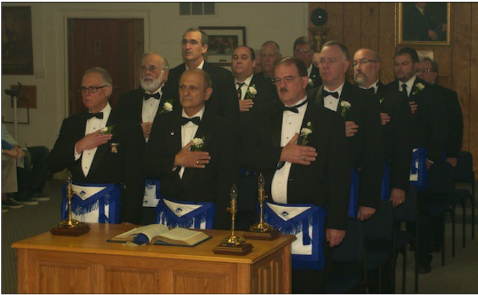
The 2013 Officers being installed during the December 15 th Open Installation.