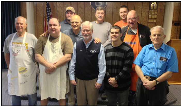
The Grand Master with the "kitchen crew" at our March 30 th monthly breakfast.