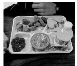
Over 40% of Virginia Beach students receive free or reduced lunch.