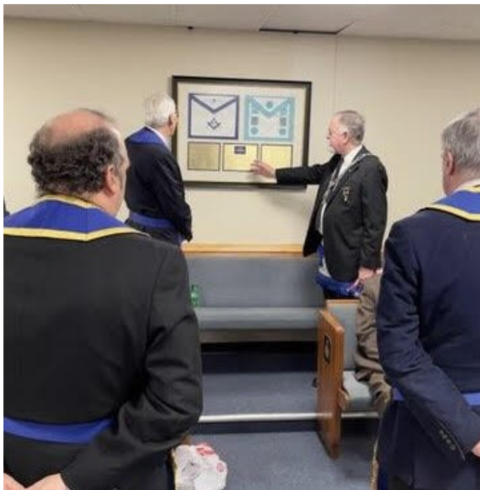
The dedication of our joint-apron display in the lodge (a similar display hangs in Lodge 261)